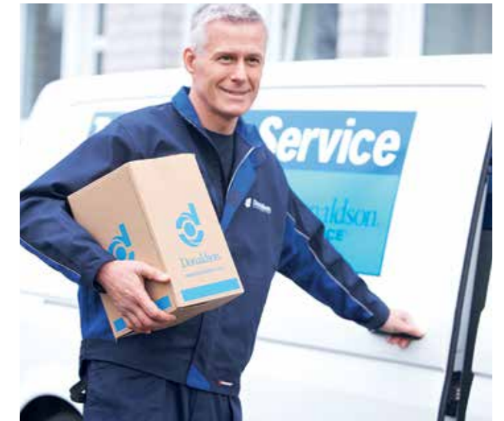
Total filtration service for compressed air.