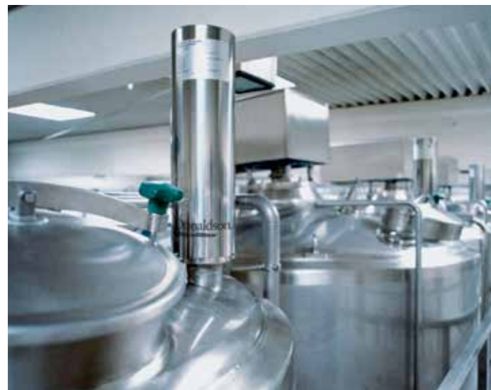
Filter housings for the aeration on storage tanks.