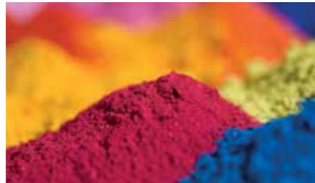
Paints and coatings