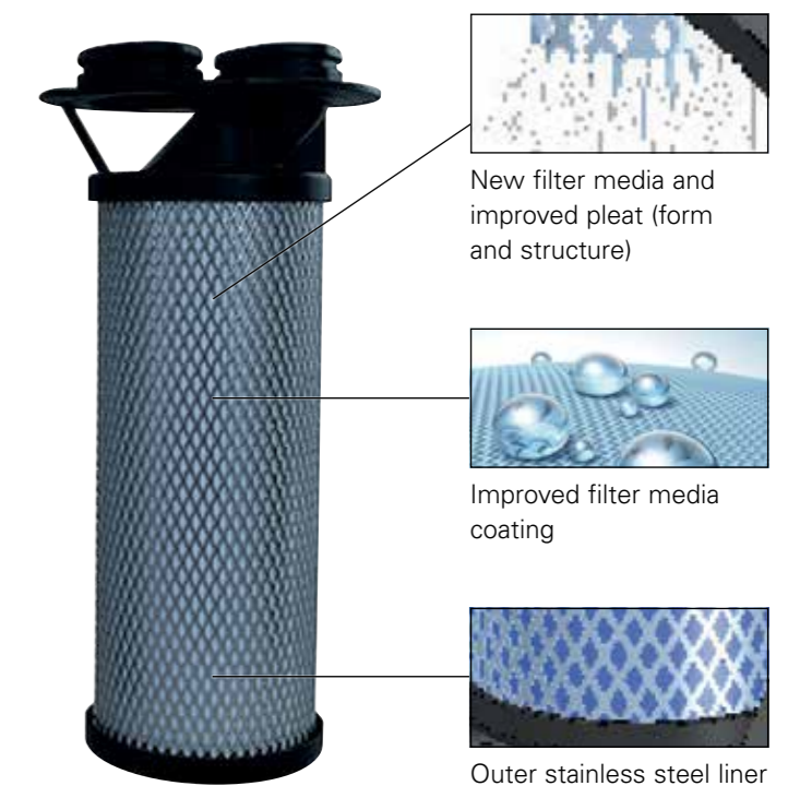
The proven UltraPleat® technology is available for filter elements S and M.