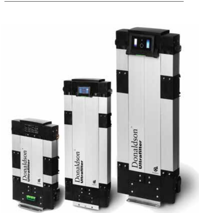
Ultracac® Smart heatless regenerated adsorption dryer for pure air.