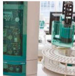
Gas, Liquid & Ion Chromatography