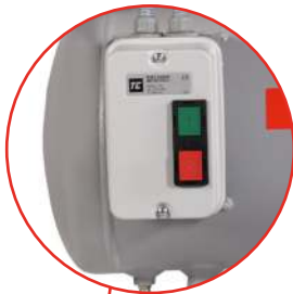
Proven pressure switch and starter