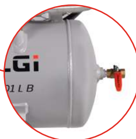
Air receiver conforming to ASME standards